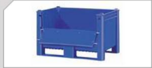
Box pallet type 800 solid w/upper door