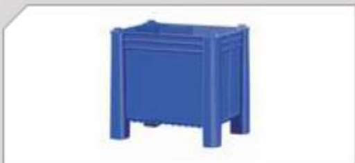
Box pallet type 800 solid SL - 600