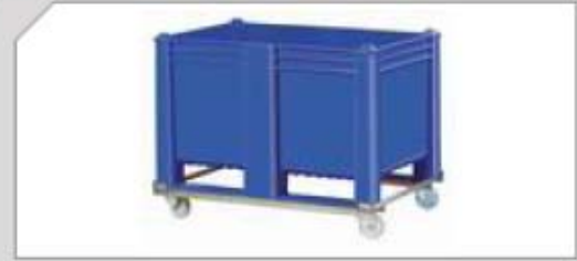
Box pallet type 800 solid w/dolly