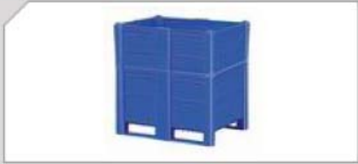
Box pallet type 800 solid SH - 1140