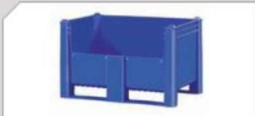
Box pallet type 800 solid w/opening