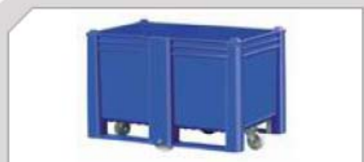
Box pallet type 800 solid w/stackable wheels