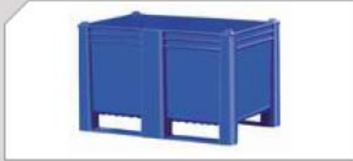
Box pallet type 800 solid - standard