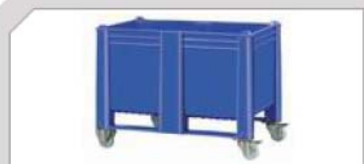
Box pallet type 800 solid w/wheels