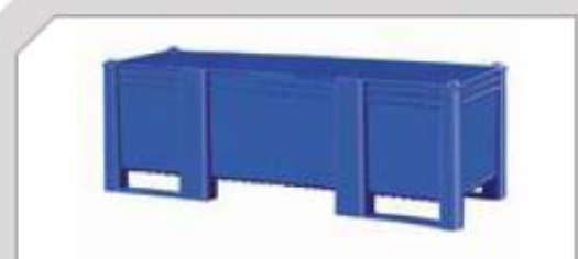
Box pallet type 800 solid SL - 2160