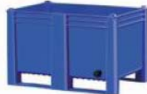
Box pallet type 800 solid w/drainage port