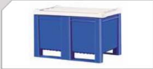
Box pallet type 800 solid w/Lid