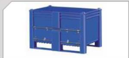
Box pallet type 800 solid w/lower door