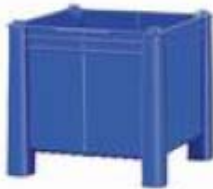
Box pallet type 800 solid SL - 800