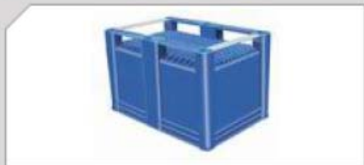
Box pallet type 800 solid w/SS runners