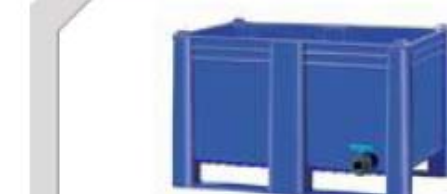
Box pallet type 800 solid w/drainage valve