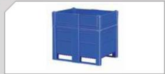
Box pallet type 800 solid SH - 1000