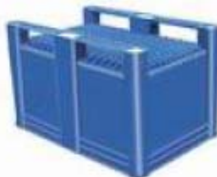
Box pallet type 800 solid USDA