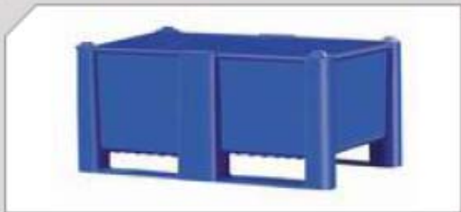
Box pallet type 800 solid SH - 540