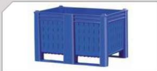
Box pallet type 800 perforated - standard