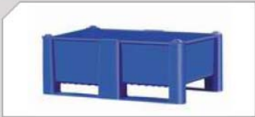
Box pallet type 800 solid SH - 440