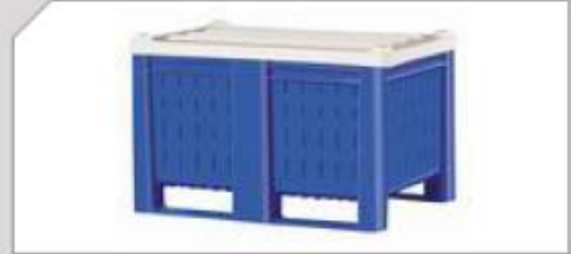
Box pallet type 800 perforated w/Lid